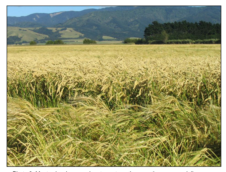
Photo 3. Monty showing superior straw strength vs another commercially available variety in the Wairarapa

Monty also has good tolerance to most leaf diseases (figure 2), but like all barleys, prevention is the best way to minimise disease pressure.